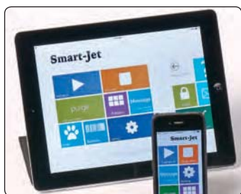
App works on Android or iOS devices