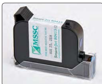
HP TIJ 2.5 technology