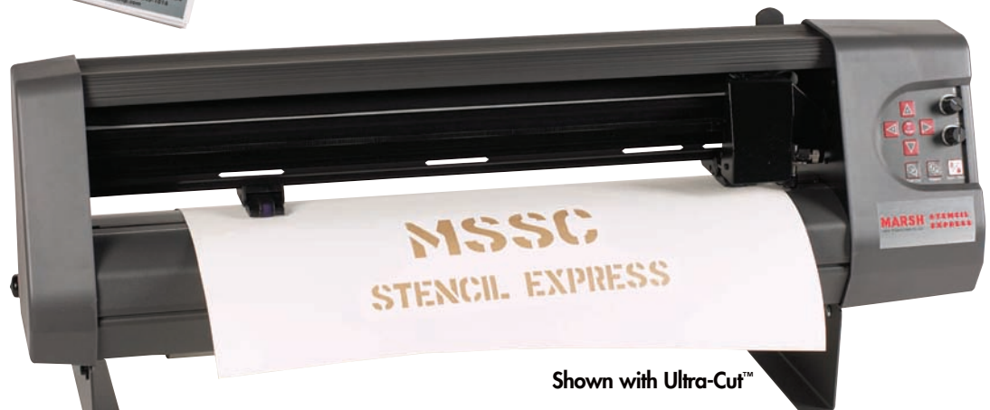
Shown with Ultra-Cut™