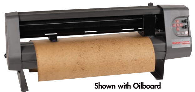
Shown with Oilboard

LINTSEC LUSH LIFE BOLD MONA PRESIDENT REDON RELIEF ROADCASE ROUNDED SERPENTINE STENCIL BLACK STENCIL EXTENDED STENCIL PLAIN TEA CHEST traffic XXBESTBETTER WHITE BOLD WINTERMUTE MANUAL BOLD PHANTOM STENCILIA A STENCILIA BOLD