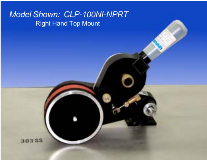
Model Shown: CLP-100NI-NPRT Right Hand Top Mount

Universal Non-Porous Conveyor Line Printers provide the ultimate in low maintenance printing on all types of non-porous materials. Unmatched in quality and performance, these printers have completely eliminated the problems associated with the use of fast drying inks.